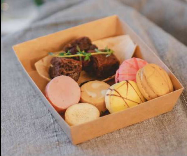
Personal Mini Box F $15/box

Minimum order of 20 boxes required per item