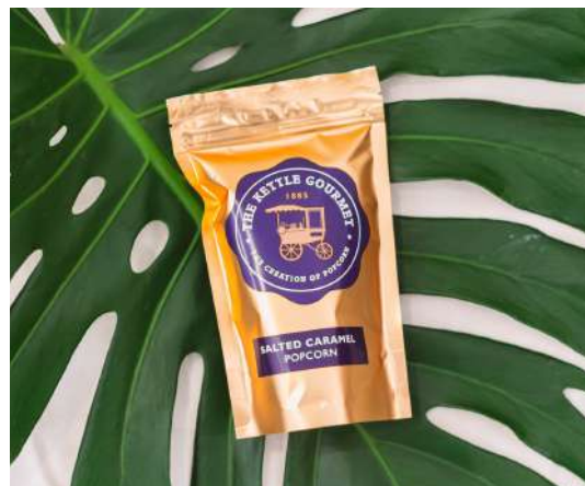
Gourmet Salted Caramel Popcorn (30g) $4.50/packet