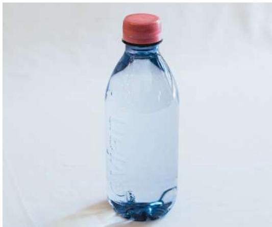
Evian Natural Mineral Water Made from Recycled Plastic (400ml) $3.50/bottle