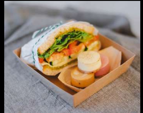
Personal Mini Box H $14.50/box