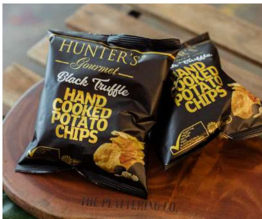
Hunter's Gourmet Black Truffle Hand Cooked Potato Chips (25g) $1.80/packet