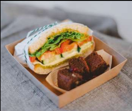
Personal Mini Box H $14.50/box