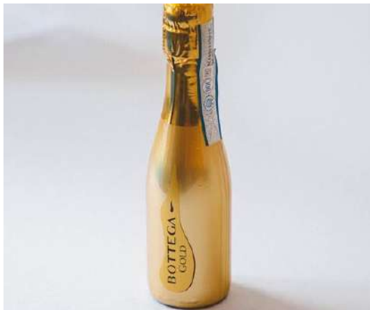
Bottega Prosecco Brut Gold NV (200ml) $22/bottle