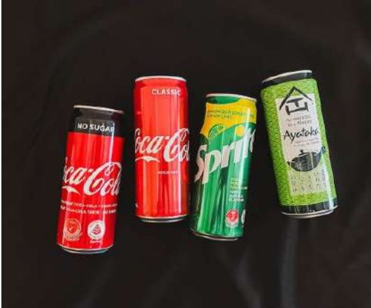
Canned Drinks (330ml) (assorted) $1.80/can