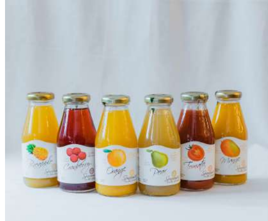
Sunraysia Juice (250ml) (assorted) $5.50/bottle