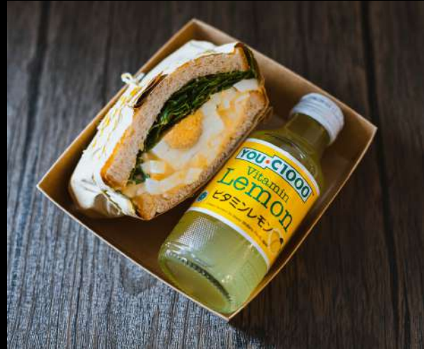
Personal Mini Box G $15/box