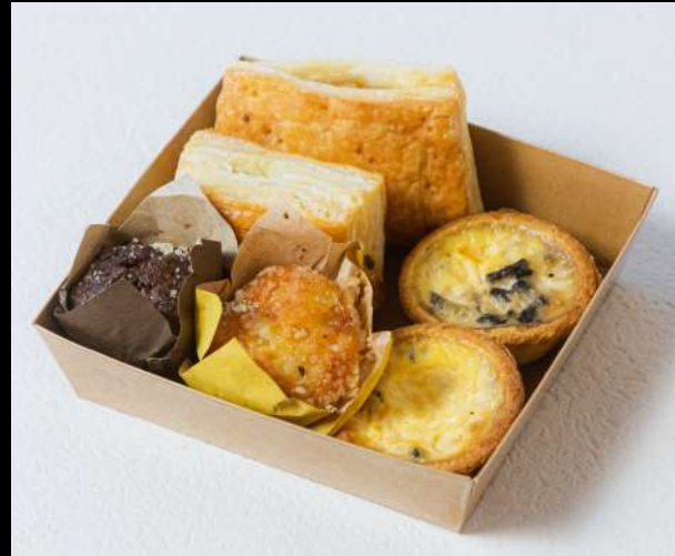
Personal Mini Box B $15/box