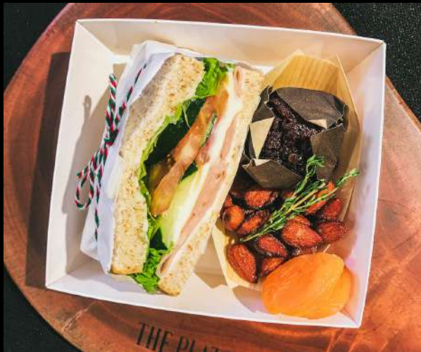
Personal Mini Box C $14/box