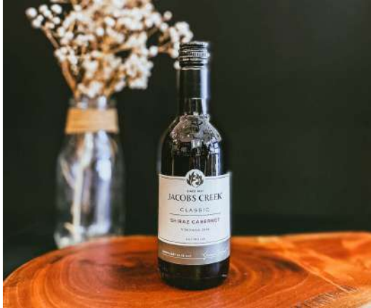
Mini Jacob's Creek Shiraz Cabernet (187ml) $14/bottle