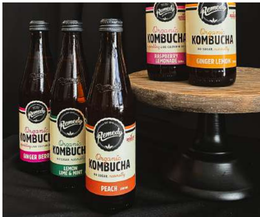
Remedy Organic Kombucha (330ml) (assorted) $6.90/bottle