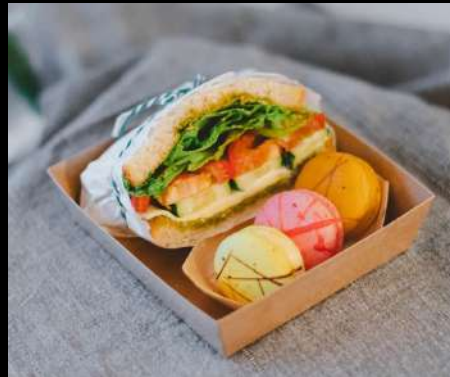
Personal Mini Box H $14.50/box