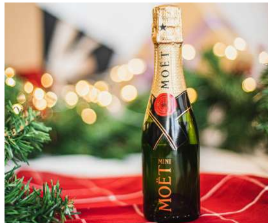
Moët & Chandon Mini Champagne (200ml) $35/bottle