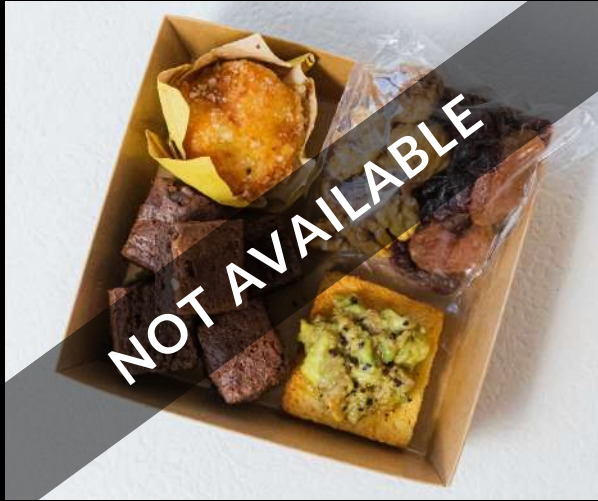
Personal Mini Box A (Veg) $15/box

Minimum order of 20 boxes required per item