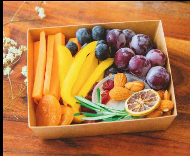
Personal Mini Box D (Veg) $14/box