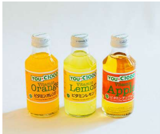
YOU-C1000 Vitamin Drink (140ml) (assorted) $2.80/bottle