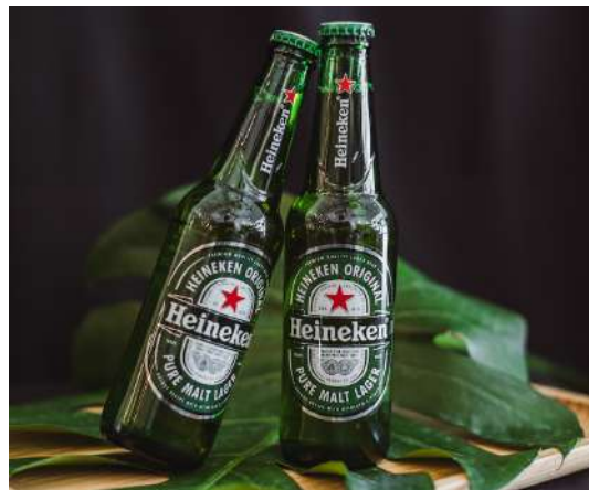
Heineken Bottle (330ml) $5.50/bottle