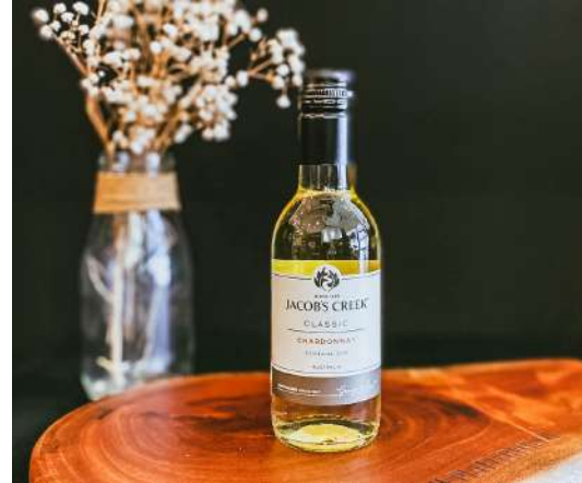
Mini Jacob's Creek Chardonnay (187ml) $14/bottle